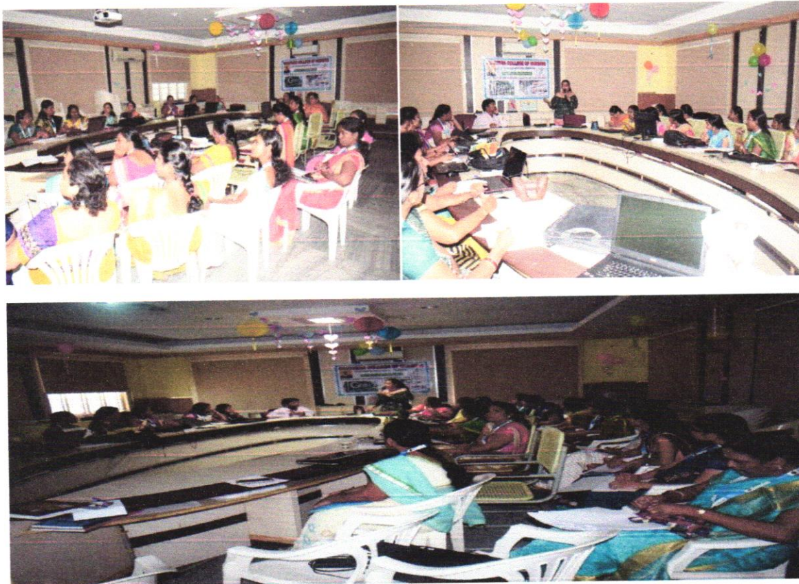
The certificates were distributed to all the delegates.